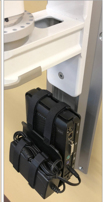
Back of Monitor (CPUMF and MINIPC1212) On Wall (CPUMF)